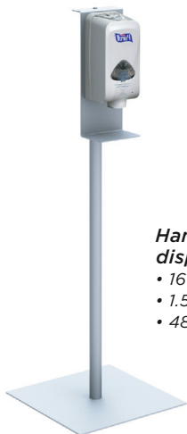
Hand sanitizer dispenser stand • 16" Base • 1.5" diameter • 48" Upright