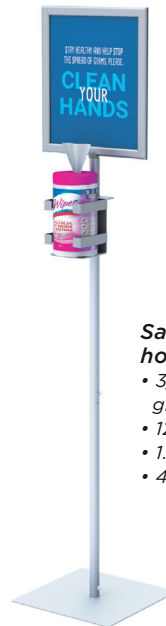
Sanitizing wipes holder with frame • 3/16" top slot for graphic insert • 12" Base • 1.5" diameter • 44" Upright