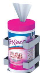
Wall mount sanitizing wipes holder • Includes mounting hardware for drywall

MASKS, DISPENSER, SANITIZER, PUMP & WIPES ARE NOT INCLUDED.