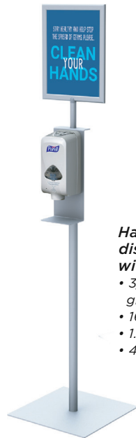
Hand sanitizer dispenser stand with frame • 3/16" top slot for graphic insert • 16" Base • 1.5" diameter • 48" Upright

Provide comfort to your customers with sanitation stations nearby. Transportable to find the most convenient place for these units.